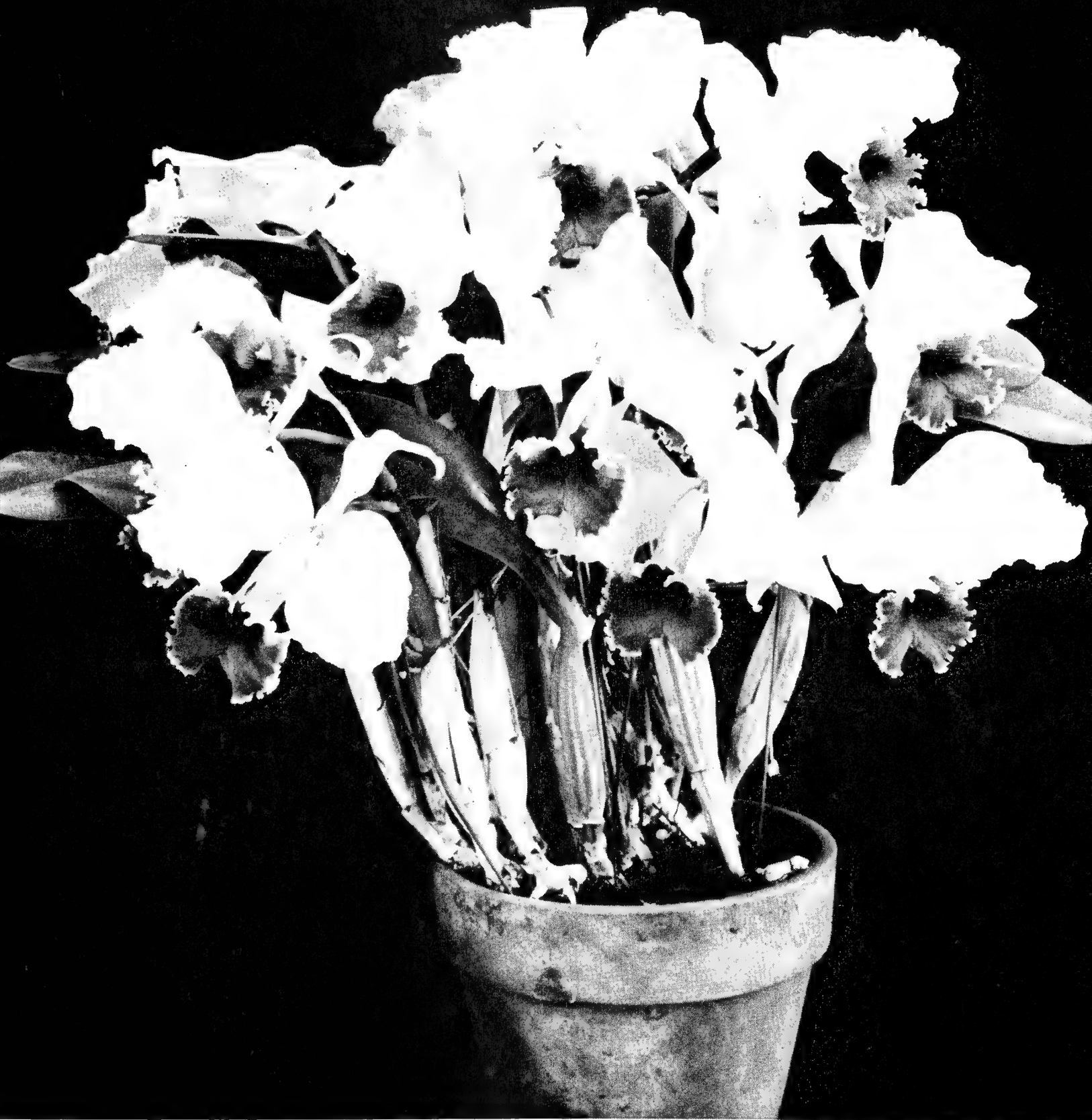
Cattleya Trimos Cross No. 1031